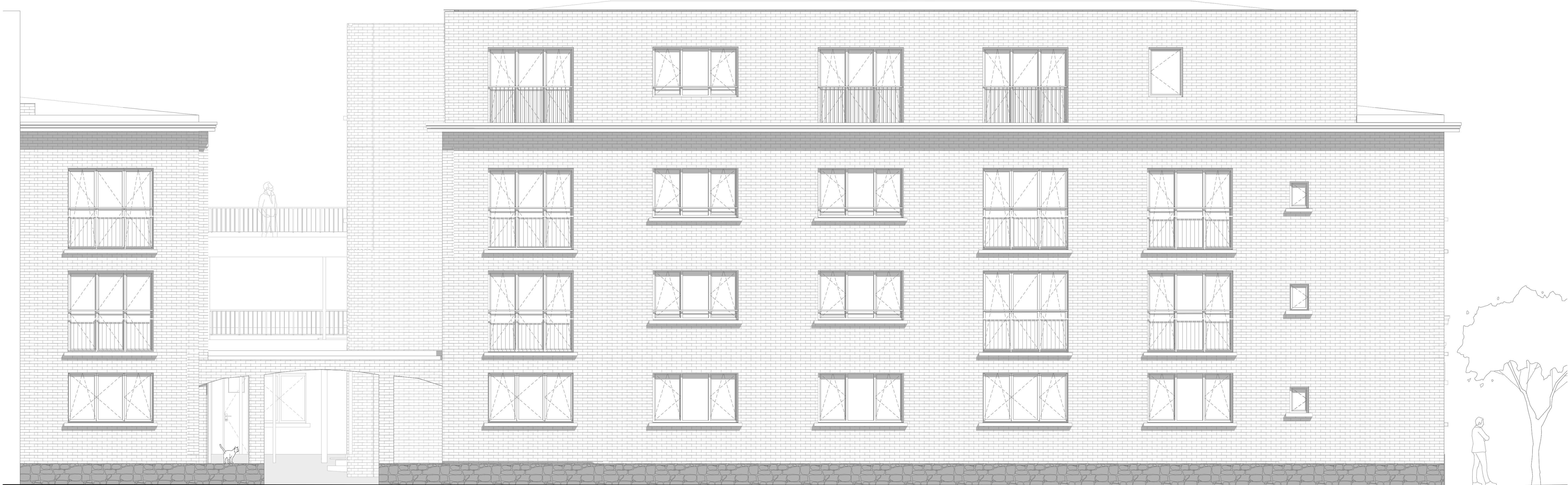
FAÇADE OUEST 1:50